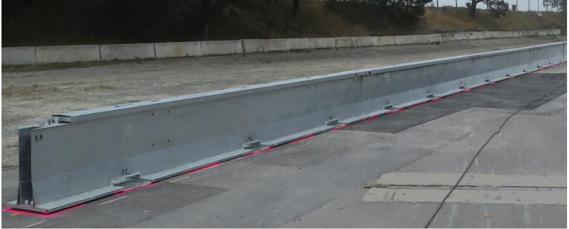
Photograph of Installation