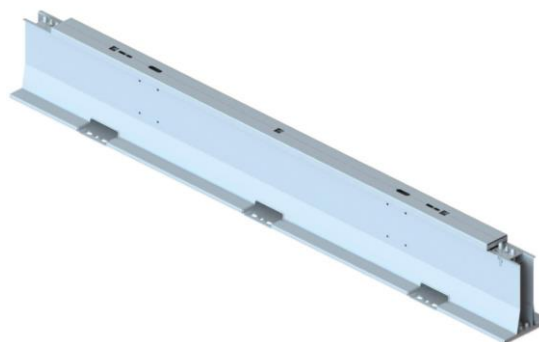
Isometric View of 6m long unit